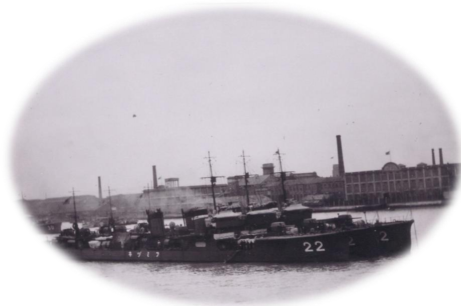
A nest of IJN destroyers (from 22nd Div) at Shanghai, ca. 1931-32; Fumizuki closest to camera.