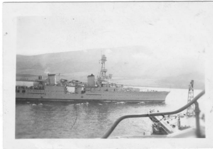
CA-30 leaves LaHaina, seen over the stern of a Brooklyn-class light cruiser.

Following much-needed upgrades at Mare Island in the fall of 1940, the Houston was to head out once more to the Philippines and the U.S. Asiatic Fleet. Around the same time, the Chief of Naval Operations (CNO) ADM Harold “Betty” Stark sent a letter to his admirals in the Pacific laying out his estimate of the situation. Stark’s November 1940 message noted the likelihood of war by Japan against an alliance of the U.S., British, and Dutch. This was a prescient document, as it turned out, with Stark anticipating many of the initial operations undertaken by Imperial Japan’s military forces a little over a year later. In his assessment, these included Japan: occupying Guam and reinforcing the Mandates; establishing naval control of the Philippine waters by destroying U.S. naval and air forces; then invading and capturing Luzon; and finally, seizing Borneo, followed by “...a campaign against the Dutch directed East to West.” What CNO Stark and the various intelligence organizations had not foreseen or anticipated were the massive raids on Pearl Harbor, the lightning invasions of Hong Kong and Malaya, destructive bombings of Douglas MacArthur’s air forces on Luzon, and the attacks on Wake and Guam...all conducted more or less simultaneously. Fatefully, it was against this uncertain yet clearly ominous geopolitical backdrop that Houston steamed once more to the Far East.