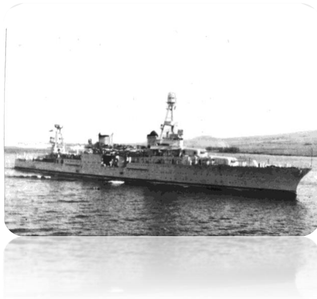
Houston departs LaHaina Roads anchorage for her last stateside refit in 1940.

After that, CA-30 became part of the so-called Hawaiian Detachment of the Pacific Fleet's Scouting Force, often operating out of the LaHaina Roads anchorage at Maui.