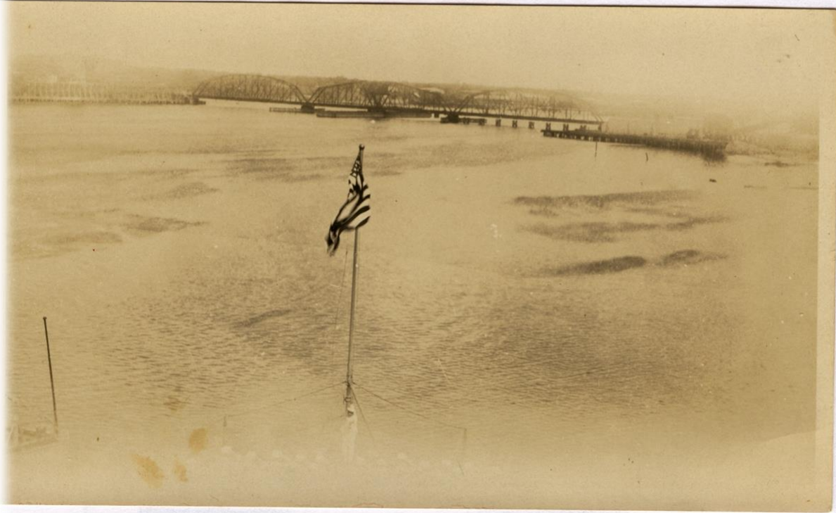
Rare photo of the commissioning ceremony on Houston , June 1930, and the first raising of Old Glory.

of Sam Houston himself. Houston was commissioned on June 17, 1930. The designation of the Northampton -class ship was later changed to CA-30 (heavy cruiser) on July 1, 1931. The alteration in type designation was primarily due to provisions of international naval treaties between the wars which distinguished between light cruisers (armed with 6.1" guns, or smaller) and heavy cruisers (up to 8" guns).