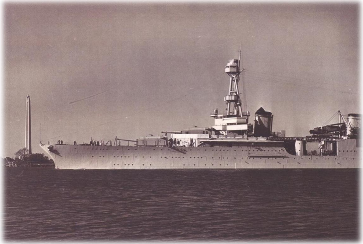
Houston passes the new San Jacinto Monument on her final hometown visit in April, 1939.

After that, CA-30 became part of the so-called Hawaiian Detachment of the Pacific Fleet's Scouting Force, often operating out of the LaHaina Roads anchorage at Maui.