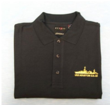
USS Houston CA-30 Men's Polo Shirts