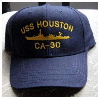
USS Houston CA-30 Hats