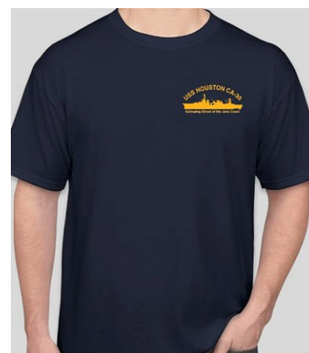
New! USS Houston CA-30 T-Shirts