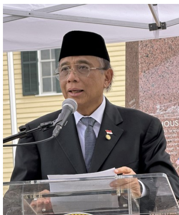
H.E. Indroyono Soesilo, Ambassador of the Republic of Indonesia to the United States, from the Embassy of Indonesia in Washington, D.C.