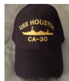
Blue Ball Cap

Blue Ball Cap ("USS Houston CA-30", 10 oz.) $15.00 Brown Ball Cap ("USS Houston CA-30", 10 oz.) $5.00 Brown & Black Ball Cap ("U.S.S. Houston CA-30 2 nd Generation", 10 oz.) $5.00