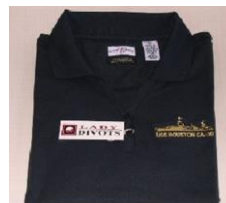
Women's Polo Shirt