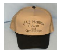
Brown & Black Ball Cap