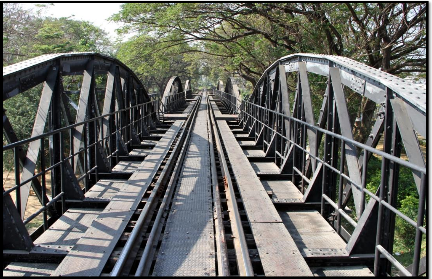
The "Bridge on the River Kwai," Burma-Thailand Railway, Kanchaniburi, Thailand.