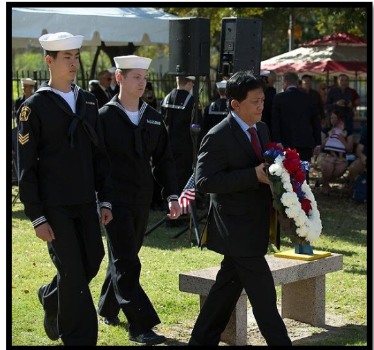
Consul-General Saroinsong of Indonesia (Right) lays a wreath at the CA-30 Monument, accompanied by two Sea Cadets.