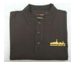
Men's Polo Shirt