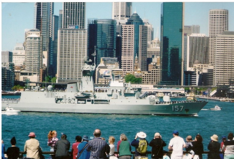
HMAS Perth-III at the 2013 International Fleet Review, Sydney, Australia.

There are still 3 survivors who live in with 2 still alive in received very special Captain of HMAS Goddard, who has of Mum and Dad. We have been included in celebrations..." –