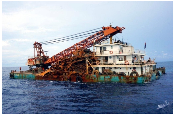
Recent salvage operations on a Dutch Submarine