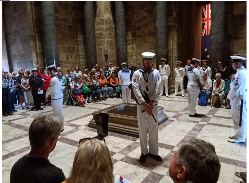
29 February 2020, Melbourne, Australia: Commemoration of the loss of HMAS Perth (D-29) and USS Houston (CA-30) at the Shrine of Remembrance.