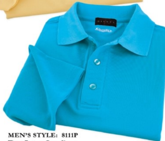
MEN'S STYLE: 8111P

Three-Button, Open Sleeve SIZES: S-3XL Available in all colors.