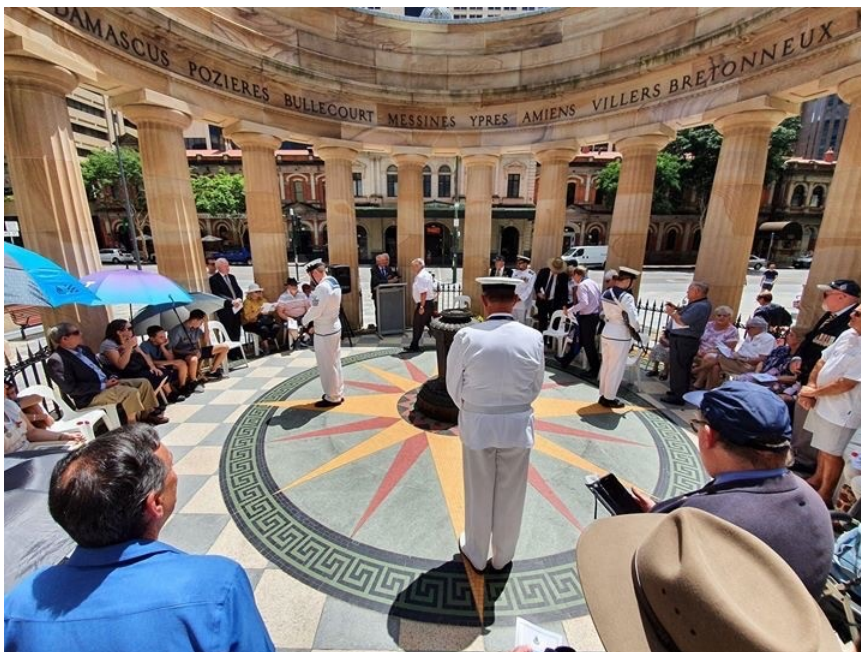
HMAS Perth (D-29) memorial service in Brisbane, Australia.