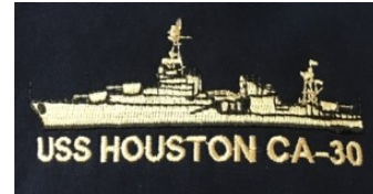
USS Houston (CA-30) Logo