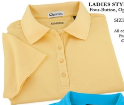
LADIES STYLE: 215L Four-Button, Open Sleeve